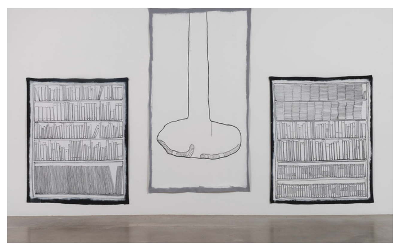
Stanya Kahn, Don't Go Back To Sleep , Installation view, SVLAP Solo exhibition, April 12 - May 24, 2014; Photo: Robert Wedemeyer / Courtesy of the Artist and SUSANNE VIELMETTER LOS ANGELES PROJECTS

The drawings are lighter in both content and craft than the video. Kahn's sense of humor and plays on word and image are inversely proportionate to polish. All black and white with very few details or backgrounds they seem like sketches, character studies, notes on or fragments of larger ideas that get worked out elsewhere. In a series of portraits of women with t-shirts that read "Mayhem" or "Fuck shit up" the meek and placid expressions of the sitters explicitly betray the message on their shirt. This joke does not end at irony; instead it becomes tension and intrigue, a battle between, to quote from the best group of drawings in the show, "that witch is above" and "that witch is below."