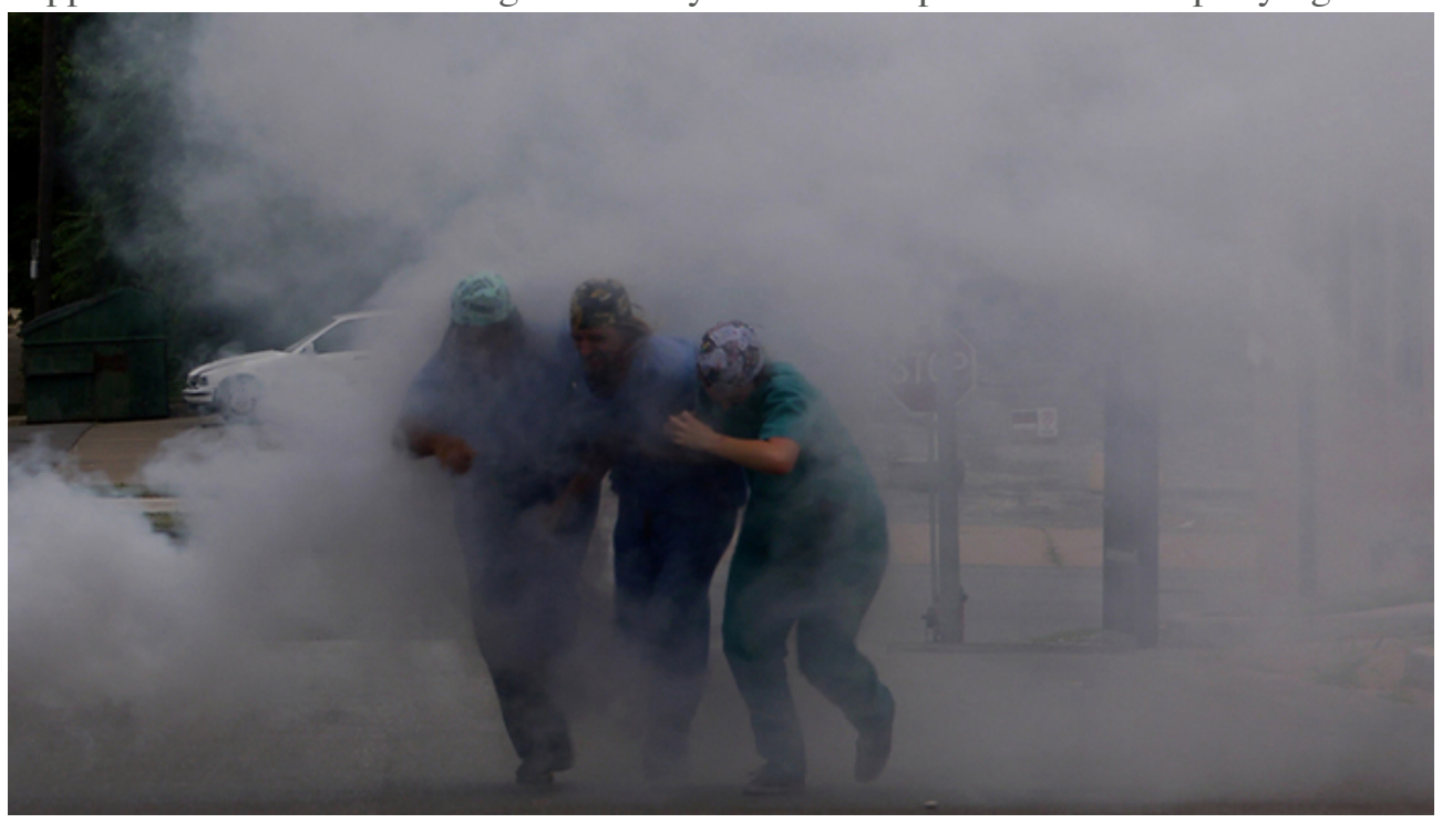
Stanya Kahn , Don't Go Back To Sleep , 2014, HD video with stereo sound, TRT 74 minutes, SVLAP solo exhibition, April 19 - May 24, 2014; Courtesy of the Artist and SUSANNE VIELMETTER LOS ANGELES PROJECTS

The urgency precipitated upon catastrophe has dissipated among the doctors. Instead they wait, banter, and bottle milk, a substance that seems to be critical to a recovery and in short supply. Occasionally they perform surgery, singing songs like "I've Been Working on the Railroad." While working inside the abdominal cavity of a patient only mildly anesthetized from a few swigs of mezcal, one doctor describes her surgical methodology to be "like popping a zit." What would normally be a doctor's primary professional function is secondary to their interactions with each other and how they cope with the passage of time. Post-surgery, the doctors and their patient hang out and relax on a big sectional couch. Unconcerned that the patient looks like the star of a remake of Weekend at Bernie's , the two doctors share stories from recurring dreams each looking to the other to validate their interpretation. It's the type of stupid yet resonant conversation that happens at 4am in the morning after everyone else has passed out from partying or fatigue.